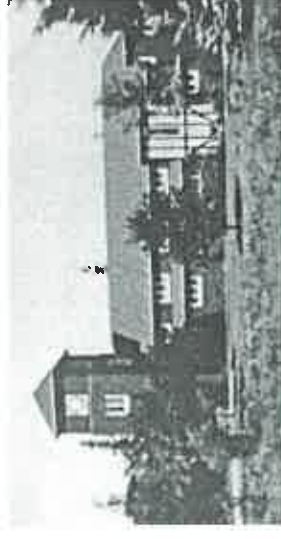
Prince of Wales Fairbridge Farm School Chapel