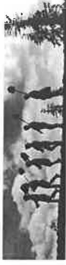
Children at the Prince of Wales Fairbridge Farm School circa 1940s.

British Child Migration has a 350-year history.