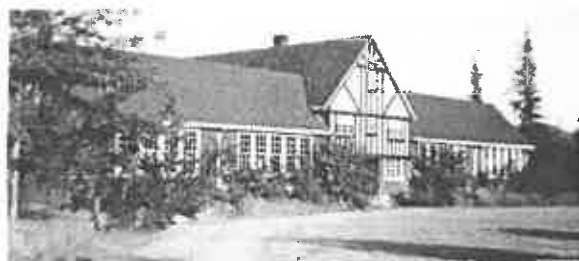
Prince of Wales Fairbridge Farm Day School late 1940s Photo courtesy of Ken Armstrong (...arrived at the Farm School in 1946)

A unique historical event occurred in British Columbia near Cowichan Station, Vancouver Island on September 25th, 1935. It was the arrival of 41 British children, the first of seventeen groups sent from the United Kingdom to the Prince of Wales Fairbridge Farm School . By the time the Fairbridge Farm School closed its doors in 1951, a total of 329 children — 97 girls and 232 boys — had started a different life in Canada.