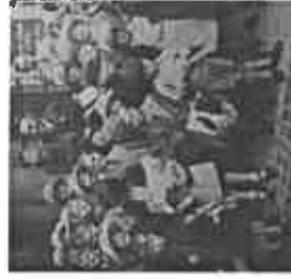
1935, September, the first group of children to be sent to the Prince of Wales Fairbridge Farm School.

https://www.cbc.ca/news/canada/british-columbia/ubc-honorary-degree-revocation-1.6056161