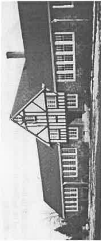
The Prince of Wales Fairbridge Farm Day School Circa 1940

Photo courtesy of Fred Harding, a former British Child Migrant sent to the Prince of Wales Fairbridge Farm School in the Cowichan Valley in November 1938.