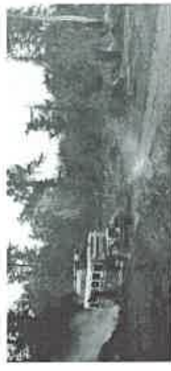
A Vancouver Island Coach Line Bus arriving at the Prince of Wales Fairbridge Farm School. Circa 1935.

I have compiled a list of over 110 individuals and agencies that made it their business to ship British children to Canada between 1833 and 1948.