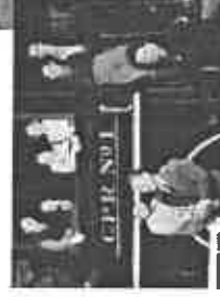
1948: May - the final 6 children arrived at the Farm School.