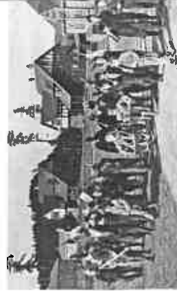
Fairbridge children getting ready for work at the Prince of Wales Fairbridge Farm School

Circa 1940s. Visit the Fairbridge Canada Association website http://www.fairbridgecanada.com/