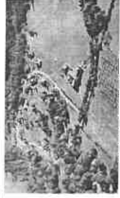
Aerial view of the Farm School - circa late 1930s.