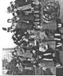
1937, September 22: the fourth group, arrived in Vancouver. Photograph by a Vancouver Sun Newspaper Reporter