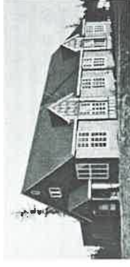
Prince of Wales Fairbridge Farm School Dining Hall