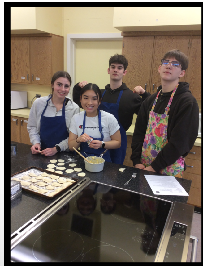
Perogies and Apple Pies in Foods 11/12