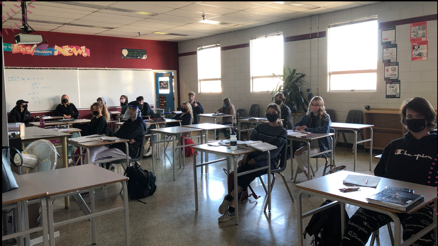
Smiling students in Math 10 (Yes, they are smiling.....under their masks :)